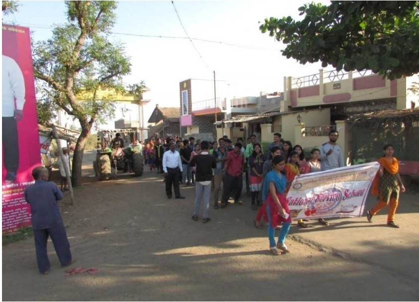
Sadbhavana Rally by NSS Volunteers

religions. AT AMGOI, Vathar on August 19, 2016 NSS organized rally at Ambapwadi and students took following pledge on that day