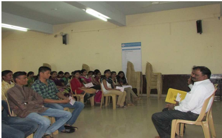
Program Officers and NSS volunteers' interaction