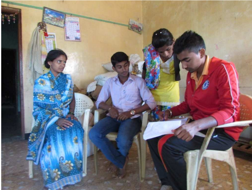
NSS Volunteers at Survey in Ambapwadi

NSS volunteers visited Ambapwadi and conducted Jandhan account survey of the villagers. Participants approached individual families and made enquiry about it. Also advised to keep all necessary documents ready to create Jandhan account of the villagers who has not having it.