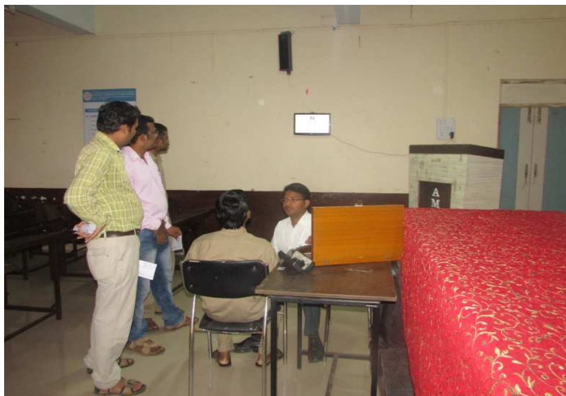
Eye checking team with patient