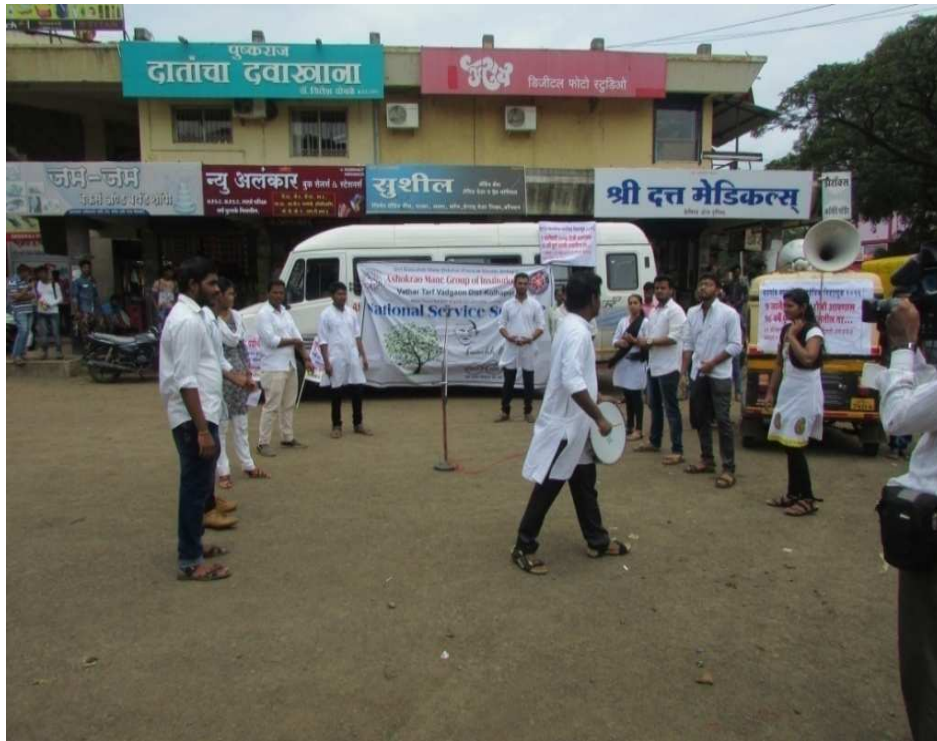
NSS Volunteers performing Pathnatya at Vadgaon