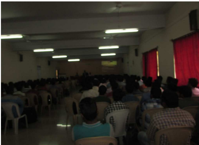
Participants attending Social Awareness through short film Festival